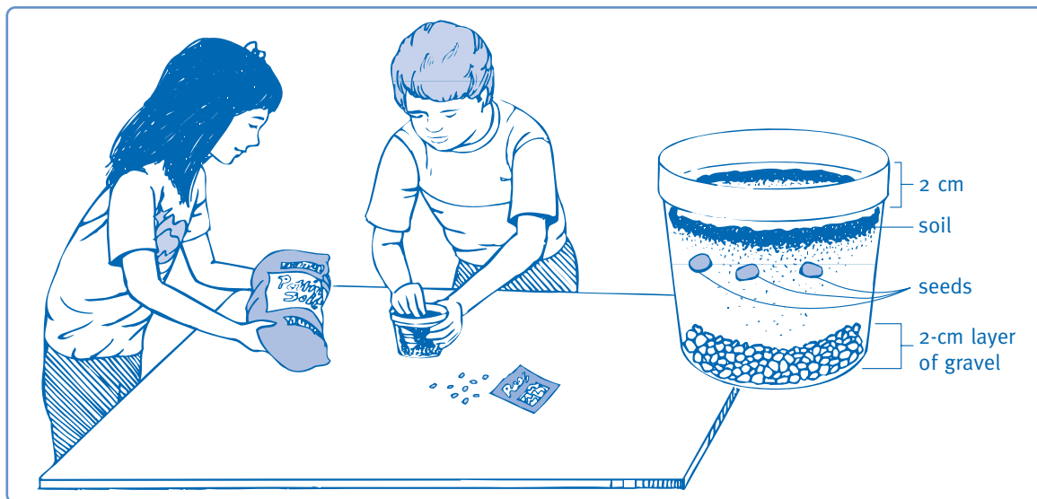
▲ Figure 2-1. Planting pea seeds.

The seeds should be planted no deeper than twice their diameter.